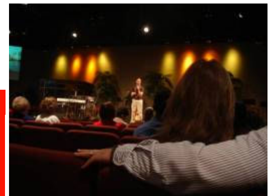
A teaser in Lakeland on the Sunday morning for the men's event Monday night