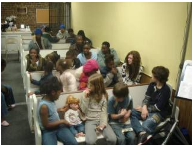
Inner City ministry in Savannah, GA. The church was so small but the power of God was great!